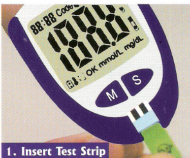
1. Insert Test Strip